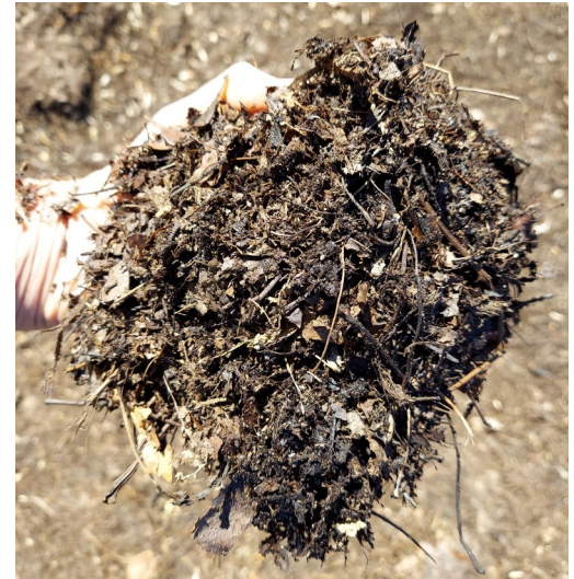
Shredded Leaf Mulch

The fall leaves from the curbside collections in the City of Manitowoc are typically shredded and stockpiled for spring. This reduces the bulk, helps moisture and air move through the piles better, and helps them compost faster. Shredded leaf mulch is blended with green materials and wood chips during the spring and summer months to make our compost recipe. Since we maintain a stockpile of these shredded leaves we can easily offer them to the public for their gardening needs.