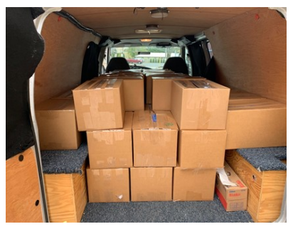
Metro Drug Unit transporting collected medications to disposal site.