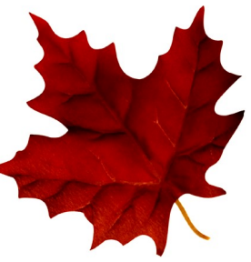
Fall leaves can make a great addition to your home compost pile. Especially if they are shredded with a mower.